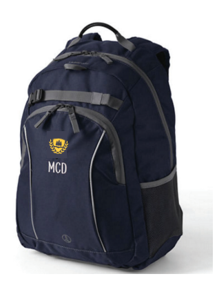
ClassMate Backpack, Navy (logo optional)