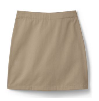
Girls Plain Front Skort, Khaki