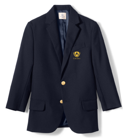
Boys Hopsack Blazer, Navy (logo required)