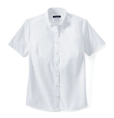
Girls Short Sleeve Blouse, White