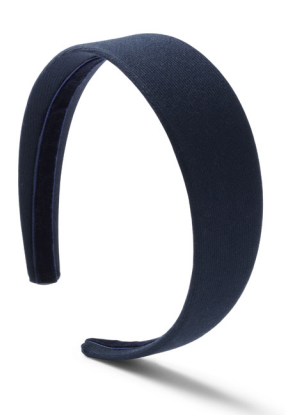
Girls School Uniform Headband, Navy or Classic Navy Plaid