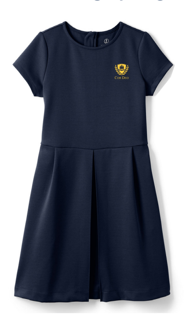
Girls Uniform Short Sleeve Ponte Dress or Ponte Pleat Jumper, Navy