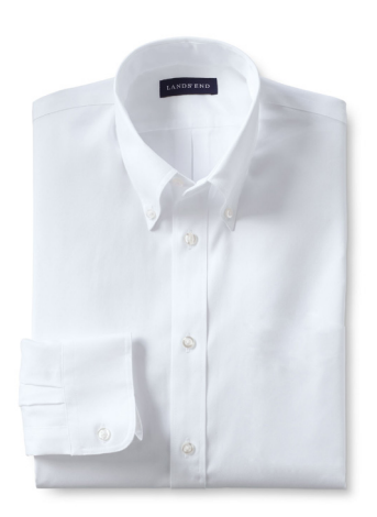
Boys Long Sleeve No Iron Pinpoint, White