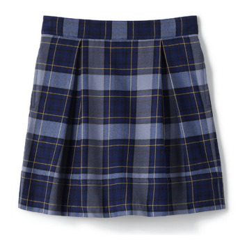
Girls Plaid Pleated Skort Top of Knee, Classic Navy Plaid