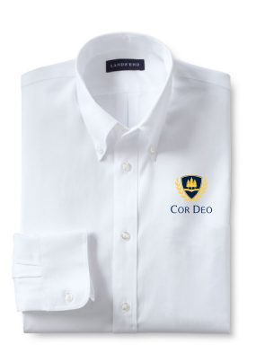
Boys Long or Short Sleeve No Iron Pinpoint, White or Blue