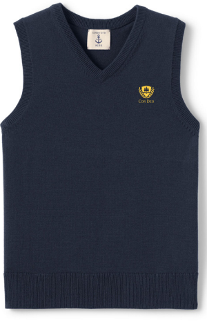
Boys Performance Fine Gauge V-Neck Vest, Navy