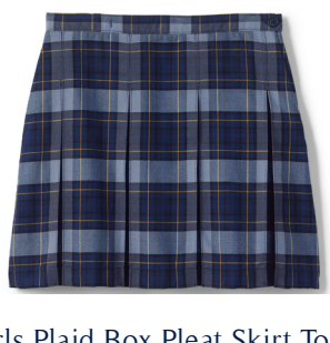
Girls Plaid Box Pleat Skirt Top of Knee, Classic Navy Plaid