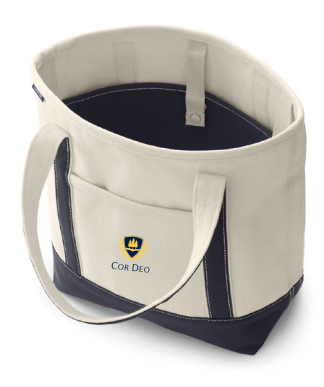
Open Top Canvas Tote, Navy (logo optional)