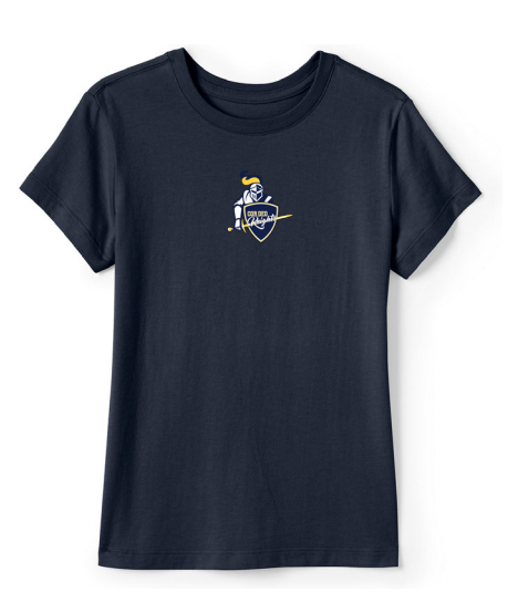
Short or Long Sleeve Essential & Performance Tees