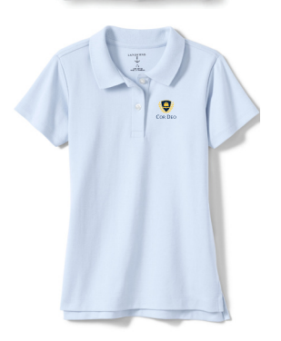
Polo Shirts, Short or Long Sleeve, Navy, White, or Blue (logo preferred but not required)