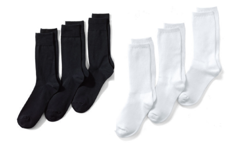
Socks, Navy, Black, or White