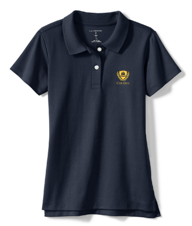
Polo Shirt, Short or Long Sleeve, Navy (logo required)