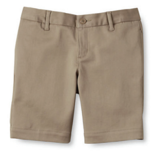
Girls Chino Plain Front Shorts, Khaki