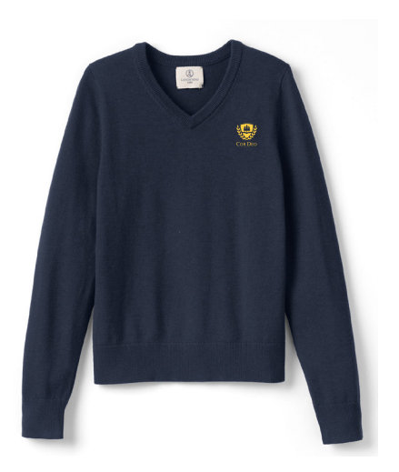
Boys Performance Fine Gauge V-Neck Sweater, Navy