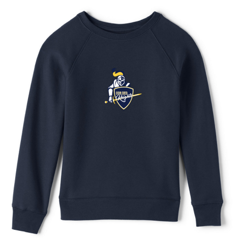
Crew Sweatshirt (May be worn at recess over collared shirt)

Available to students, staff, and parents for weekend and special event wear. Available through Lands' End.