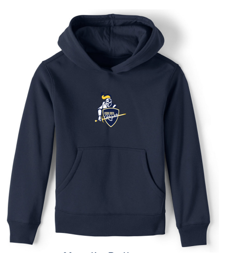
Hoodie Pullover Sweatshirt (May be worn at recess over collared shirt)