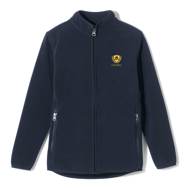
Fleece Jacket, Navy (logo required)