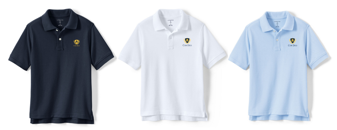
Polo Shirts, Short or Long Sleeve, Navy or White (logo preferred but not required)