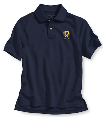
Polo Shirt, Short or Long Sleeve, Navy (logo required)