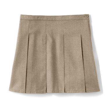
Girls Solid Box Pleat Skirt Top of Knee, Khaki