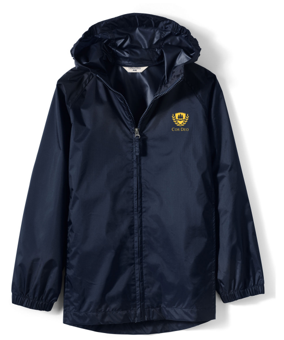
School Uniform Packable Rain Jacket, Navy (logo optional, fleece lined option also available)