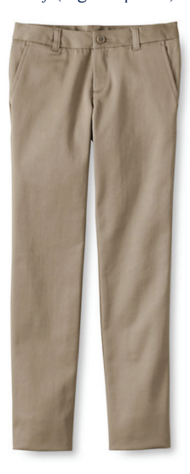
Girls Chino Pants, Shorts, or Skort, Khaki