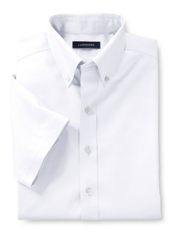
Boys Short Sleeve No Iron Pinpoint, White