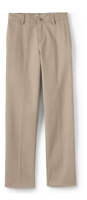
Boys Plain Front Chino, Khaki