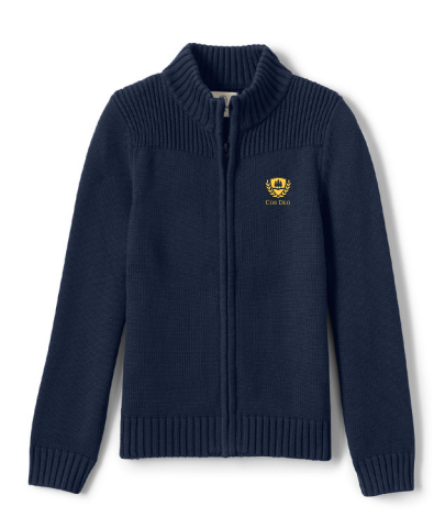
Boys Performance Zip-Front Cardigan, Navy