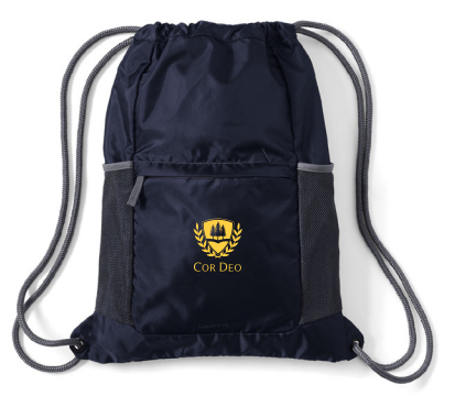
School Uniform Packable Cinch Sack, Navy (logo optional)